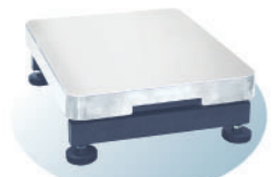
F: 400 × 500mm 420 × 520mm 600 × 800mm