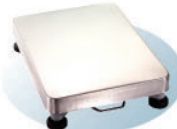
D: 420 × 520mm